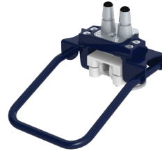
Philips Table Top Mount