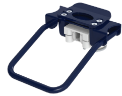
Mindray Mounting Adapter