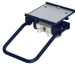
5" Plunge Plate